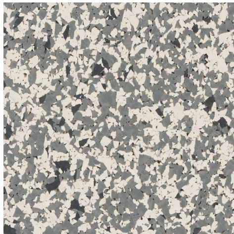
everroll® Intensity Berlin