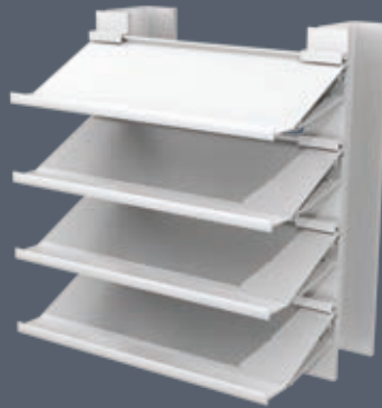
VERT-A-CADE 304, 60% free area