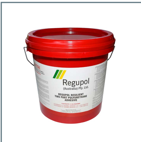
Regupol Resilient Two Part Polyurethane Adhesive