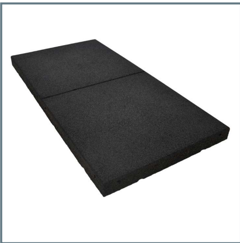
Regupol® FX50 Safety Tiles