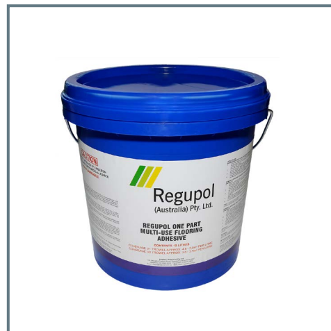
Regupol One Part Multi-Use Flooring Adhesive