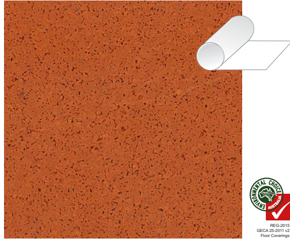
everroll® Shape Amsterdam - Rolls