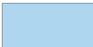
11 Alpine Blue

Note: Due to the limitations of the printing process, actual colours may vary from printed version. Samples of colours are available upon request on 1300 272 602