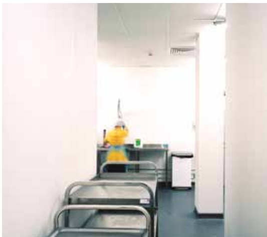
Trim jointing in the hospital kitchen corridors