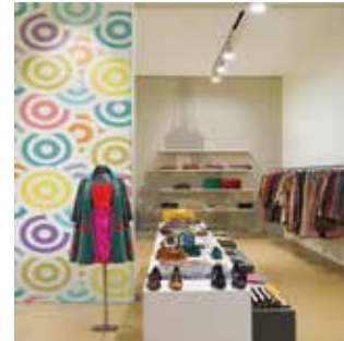
C/S Acrovyn® Imagine Panels