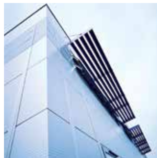
C/S Airfoil® Solar Shading Systems