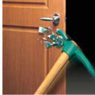
C/S Acrovyn® Doors