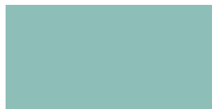
879 Dusty Jade