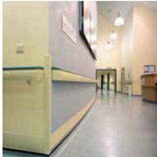
C/S Acrovyn® Wall and Corner Protection