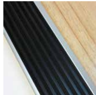
C/S Stair Nosing Architectural & Industrial Stair Nosing