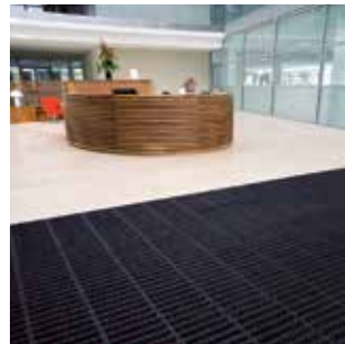
C/S Pedisystems® Entrance Matting Systems