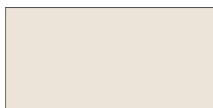
801 Grey Cloud