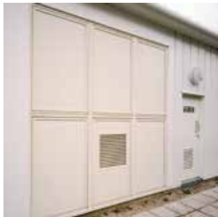
C/S Explovent® Explosion Venting Systems