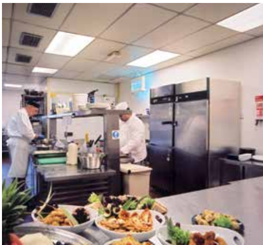
Mastic joints in a busy commercial kitchen