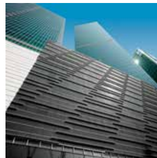
C/S Louvres Performance Louvre Systems