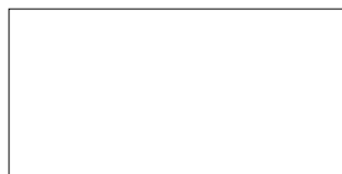
9003 Snow White