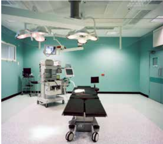
Welded joints in the operating theatre environment

Acrovyn® Hydroclad smooth wall cladding provides an impervious hygienic and impact resistant surface for internal walls. It is particularly suitable for hygienically sensitive areas such as food processing and preparation areas, laboratories, medical and surgical facilities, which require a smooth, seamless and easy to clean surface. Acrovyn® Hydroclad is easy to install and with several jointing options, there is a solution for all technical requirements.