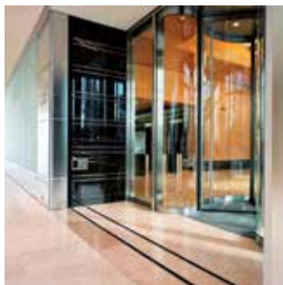
C/S Allway® Expansion Joint Covers