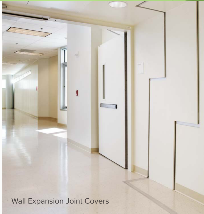
Wall Expansion Joint Covers

Aesthetically appealing covers for structural gaps. Available in a broad range of designs.