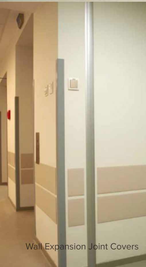
Wall Expansion Joint Covers

ONE OF THE MOST COMPREHENSIVE RANGES IN THE WORLD