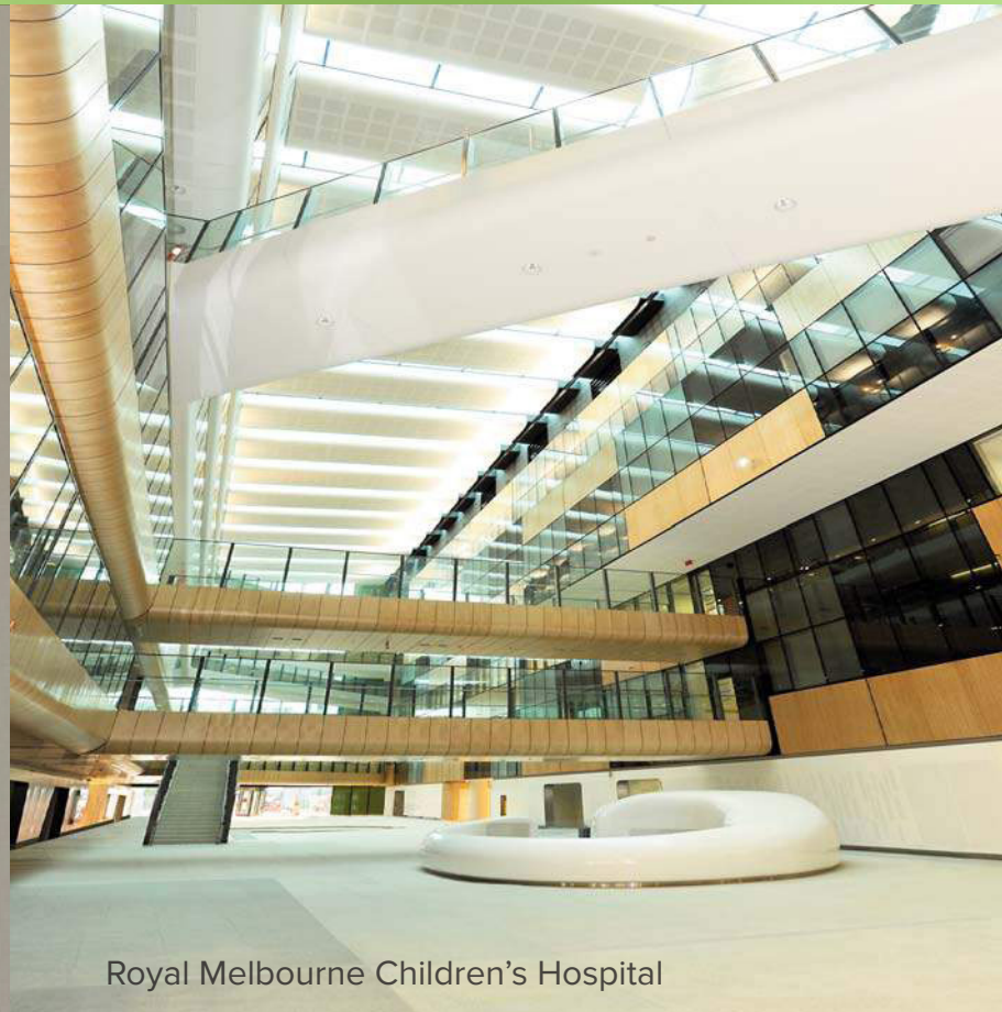
Royal Melbourne Children's Hospital

1500 METRES OF CS EXPANSION JOINTS INSTALLED IN ROYAL MELBOURNE CHILDREN'S HOSPITAL