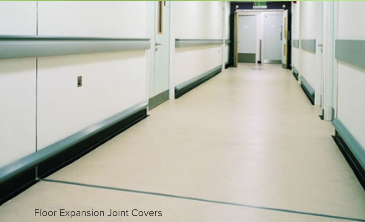
Floor Expansion Joint Covers